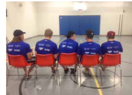
New Path Staff at "CYW Day" during Children's Mental Health week.

98% of clients reported an overall satisfaction with the service they received.